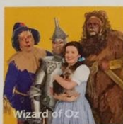
Wizard of Oz

DEC. 18 GO WEST! CRAFT FEST Find more than 80 local artists creating things like jewelry, ceramics, stationery and more. Located at The Rotunda on 40th and Walnut streets, you'll be able to get your holiday shopping done inside a gorgeous historic sanctuary. Free and open to the public. 40th and Walnut streets, gowestcraft-fest.com